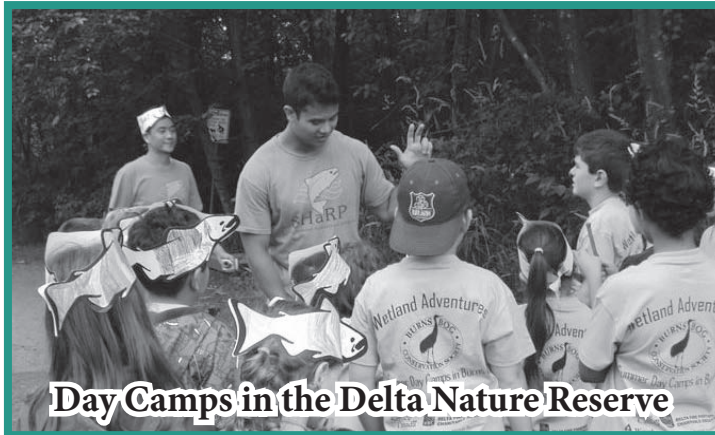
Day Camps in the Delta Nature Reserve

Our 2013 day camp registration is OPEN! This is a rare opportunity for environmental education & outdoor activities for kids aged 5-12. The camps are planned so that all children have the opportunity to learn about the bog & their relationship to nature, while having FUN! Each day has a range of activities which include crafts, science, games, team activities.